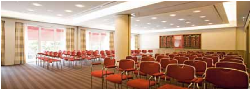
1. Etage, große Fensterfront mit Balkon zur Rothenbaumchaussee. Teilbar in 2 Sektionen. 166 m 2